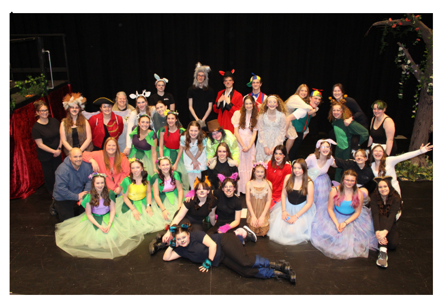
"Alice in Wonderland" production at Coaldale Prairie Winds Secondary