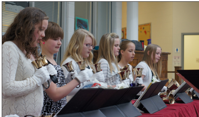
Coalhurst Elementary School's handbell group performs for the Board.

Coalhurst Elementary is a preschool to Grade 6 school serving about 275 students. In 2011, CES was named a School of Distinction by the Awards for Excellence in Education for improvement in academics. In 2009, the school was recognized by the Garfield Weston Awards in two categories: Determination in Academic Achievement and Improvement in Academics.