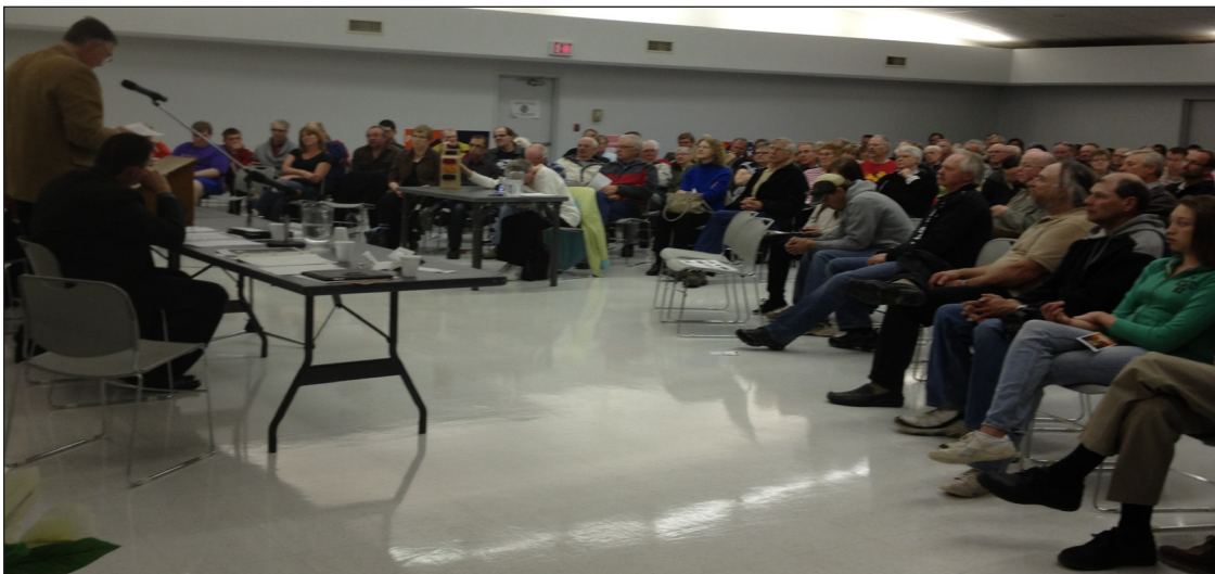
There was a standing room only crowd at the Coaldale Chamber of Commerce and Palliser Regional Schools election forum.

The Board approved the Audit Tender documents